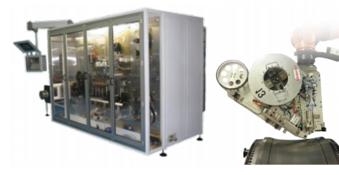
10 axis digital machine with 7 ultrasonic sealing systems