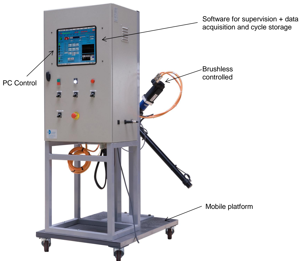
Picture 2: RTM Unit with PLC (This presentation of the equipment can be adapted to customer specification).

The system is used to stir resin inside of the piston and to record temperature of resin in the piston prior to inject. This cap needs to be removed before the injection.