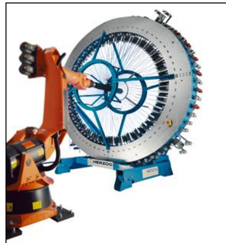
Radial braiding machine type with 144 carriers with multiaxial manipulator

Quantity of braiding carriers, moved by horn gears during braiding, is defined by customer depending on a size and complicity of preform manufactured and can vary from 48 to 288.