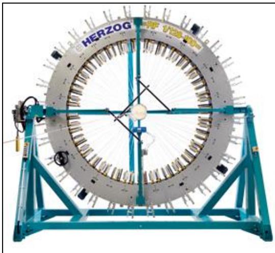
Radial braiding machine type with 128 carriers

Construction, control system and software provide machine operation with separate multi-roller take-off and multiaxial manipulator on the base of robot type KUKA according to programmed algorithm.